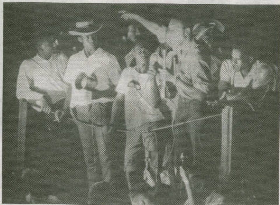
The new Student Nonviolent Coordinating Committee chairman Stokely Carmichael proclaims a "black power" slogan at the rally in Greenwood on June 16, six weeks after his independent-voting effort in Londes County was either scorned or ignored.