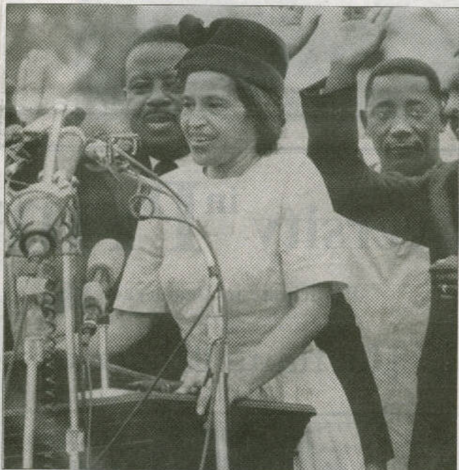
Rosa Parks speaks to the crowd before King's address on the triumphs and pitfalls of the modern civil-rights movement.

▀ Our lives begin to end the day we become silent about things that matter. ▀